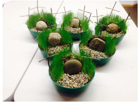
The Easter Gardens our Sunday School kids planted. He is risen! He is risen indeed! Alleluia!

have responded of having a specific time for us to run bingo, starting at 3 p.m. until 8 p.m. We have checked with the bingo chairs and they are willing to run bingo.