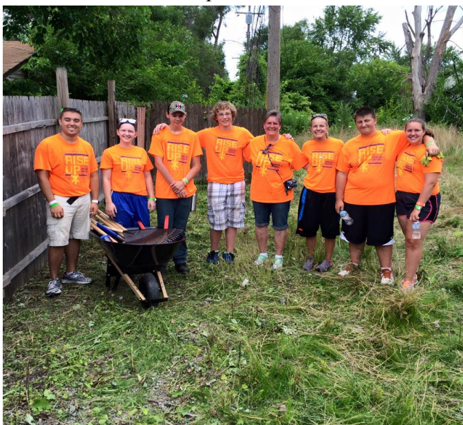
A group shot on our Service Project Day. The heat index was 100 degrees that day.